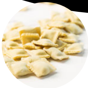
Ravioli 25mm x 25mm Square