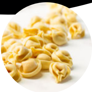
Tortellini 20mm Hats