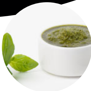
Plant-based Basil Pesto Pouch with Twist Top VE DF GF PESV850