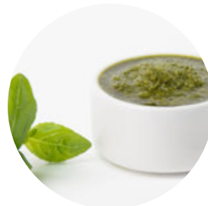
Plant-based Basil Pesto Pouch with Twist Top VE DF GF 850g PESV850 Frozen | 12 week shelf life