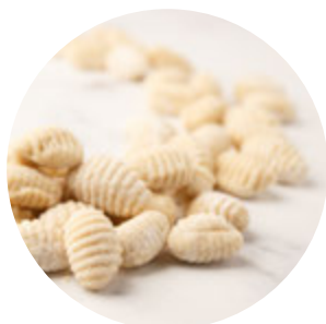
Gnocchi 30mm Dumplings