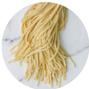
Fettucine 5mm Flat Cut V DF Traditional FETP10 Tricolore FETF10