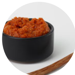
Sun-dried Tomato Pesto Pouch with Twist Top V GF PESST850