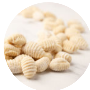
Gluten-free Gnocchi 25mm Dumplings V DF GF 1kg GFGNOP Frozen