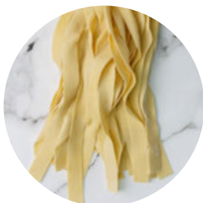
Pappardelle 20mm Flat Cut V DF PAPP