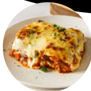
Gluten-free Beef Lasagne GF 6 x 270g Pcs GFLASB6 Frozen