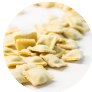
Plant-based Ravioli 25mm x 25mm Square VE DF Spinach & Ricotta 1kg RAVVEGSR Chilled