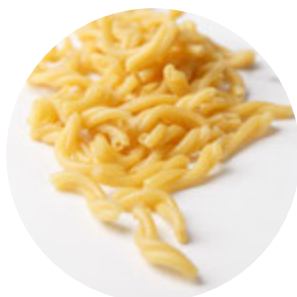
Cassarecce Short Twisted VE DF CASP10