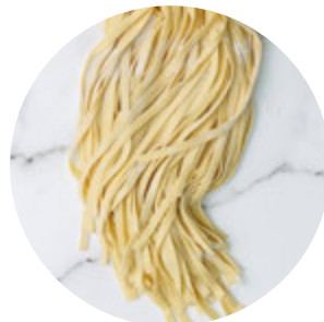
Gluten-free Tagliatelle 8mm Flat Cut V DF GF 500g GFTAGP500 Frozen