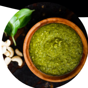
Basil Pesto Pouch with Twist Top V GF PESB850