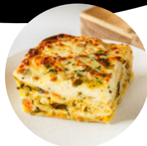
Gluten-free Roasted Vegetable Lasagne V GF 6 x 270g Pcs GFLASV6 Frozen