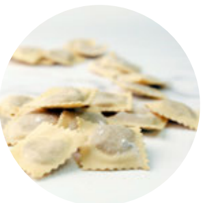
Ravioloni 50mm x 50mm Square