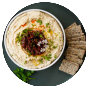
Traditional Hummus Pouch with Twist Top VE DF GF HUM850