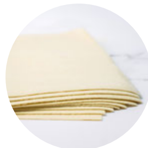
Gluten-free Lasagne Sheet 230mm x 265mm V DF GF 1kg GFLASSH Frozen