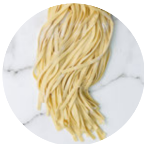
Tagliatelle 8mm Flat Cut V DF FETP10