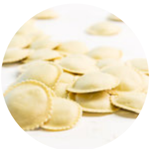
Pansotti 60mm Circle Mushroom, Walnut & Feta PANMWF V