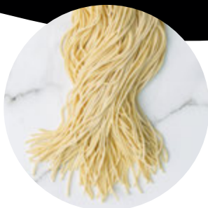
Spaghetti 2mm Square Cut V DF SPAP10