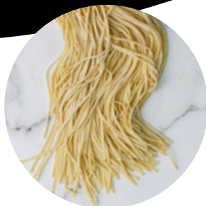
Linguine 2mm Flat Cut V DF LINP10