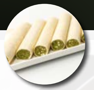
Cannelloni Spinach & Ricotta CANSR80 20x80g Pcs