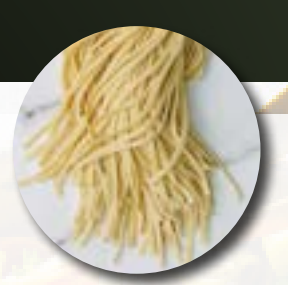
Fettuccine FETP10 5mm Flat Cut