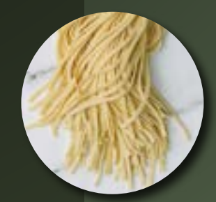
Ribbon Cut Pasta

We use locally sourced, fresh produce to fill our delicious filled pastas.