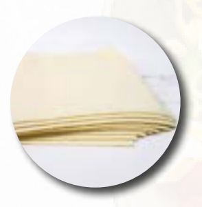
Lasagne Sheet LASSH10 230mm x 265mm