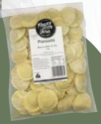
Our 1KG bags of frozen pasta make for less waste and an efficient way of cooking