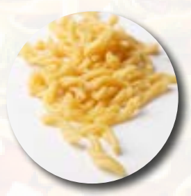
Casarecce CASP10 Short Twisted