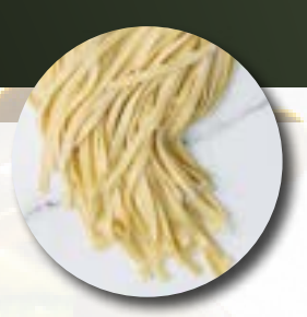
Tagliatelle TAGP10 8mm Flat Cut