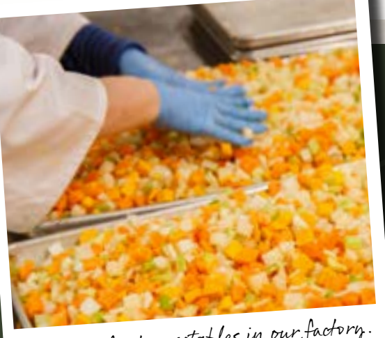
Roasting fresh vegetables in our factory.