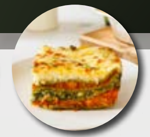
Pumpkin, Spinach & Feta Lasagne