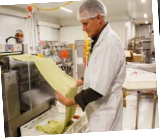
All of our pasta is made in Christchurch.