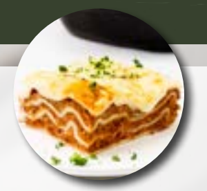
NZ Premium Beef Lasagne

Weight as Indicated Frozen 52 week shelf life