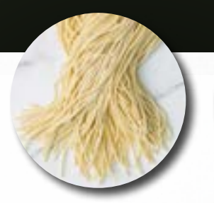
Spaghetti SPAP10 2mm Square Cut