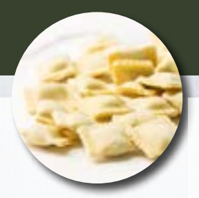
Ravioli 25mm x 25mm Square