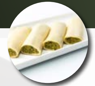
Cannelloni Chicken & Spinach CANCS80 20x80g Pcs