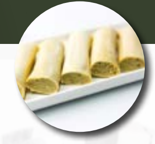
Cannelloni Spinach & Lentil CANSL80 20x80g Pcs