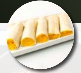
Cannelloni Pumpkin & Feta CANPF80 20x80g Pcs