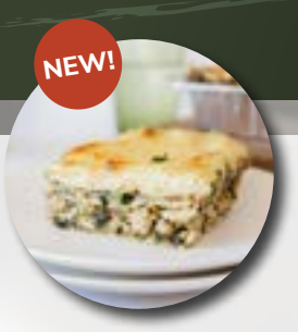
Chicken & Basil Lasagne