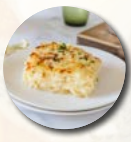
Macaroni Cheese with Cauliflower