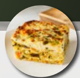
Roasted Vegetable Lasagne