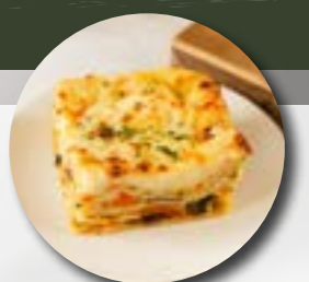
Smoked Chicken Lasagne