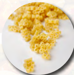
Teddy Bears TEDDY

Teddy Bear shaped pasta. Perfect for your next kids menu!