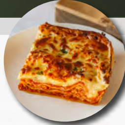
Chicken & Vege Lasagne