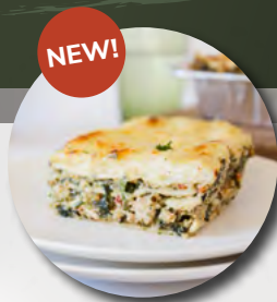
Chicken & Basil Lasagne