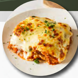
Prime NZ Beef Lasagne