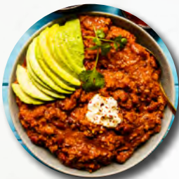
Chilli Con Carne