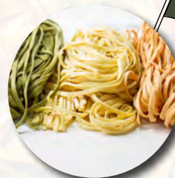
Fettuccine Tricolore FETF10 Spinach, egg & tomato.