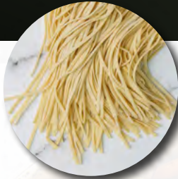
Linguine LIN10 2mm Flat Cut