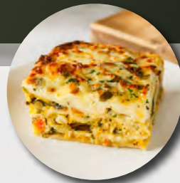
Roasted Vegetable Lasagne