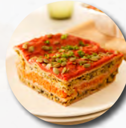
Gluten Free Vegan Lasagne with Roasted Veggies

3KG Tray GFLASVEGAN3 Vegan & Gluten Free Dairy Free