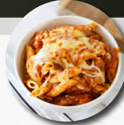
Penne NZ Beef Bolognese