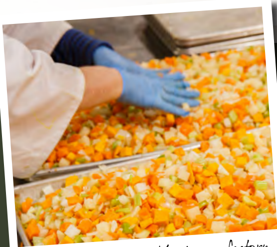
Roasting fresh vegetables in our factory.

Vegan & GF Check out our great range of Vegan & Gluten Free options on page 6.