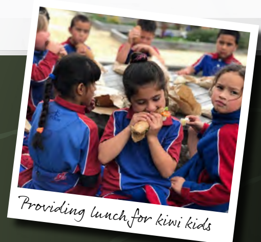
Providing lunch for kiwi kids

We've been proudly providing lunches to schools since the beginning, and now our range is available to schools, preschools, camps, and more. Designed to meet strict nutritional guidelines, our meals are perfect for menus catering to kids