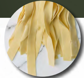
Pappardelle PAPP 20mm Flat Cut