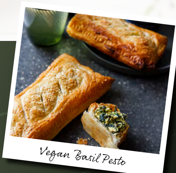
Vegan Basil Pesto

From pizza to platters, pasta and everything in between... Our Vegan Basil Pesto (made with fresh basil and pumpkin seeds) has become one of our best sellers.