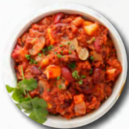
Vegetable Chilli on rice