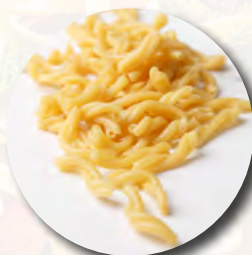
Casarecce CASP10 Short Twisted