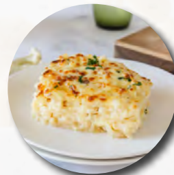
Macaroni Cheese with Cauliflower