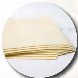
Lasagne Sheet LASSH10 230mm x 265mm