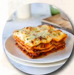
Mushroom & Lentil Lasagne