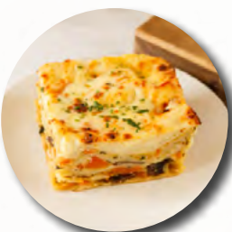
Smoked Chicken Lasagne