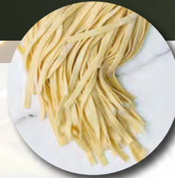
Tagliatelle TAGP10 8mm Flat Cut