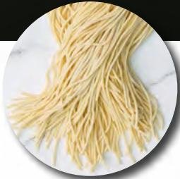
Spaghetti SPAP10 2mm Square Cut