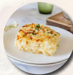
Macaroni Cheese with Cauliflower