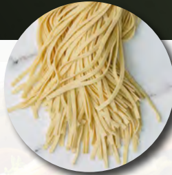
Fettuccine FETP10 5mm Flat Cut