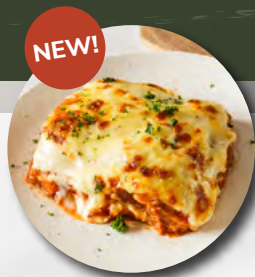
Ready-to-Bake Beef Lasagne