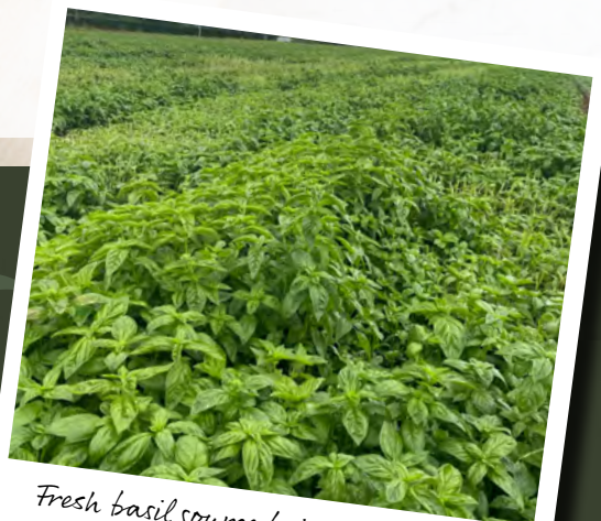
Fresh basil sourced right here in NZ

Our fresh Basil is carefully sourced from a farm in Cambridge and delivered fresh to our Christchurch facility. This allows us to produce our popular pesto products on-site, ensuring exceptional quality and freshness every time