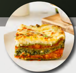
Pumpkin, Spinach & Feta Lasagne