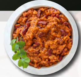
Chilli Con Carne on rice